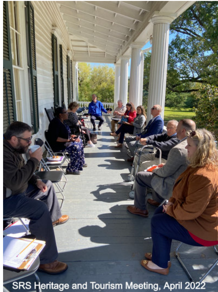
SRS Heritage and Tourism Meeting, April 2022