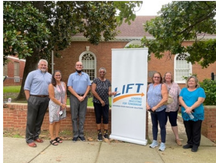
A group of SRNS Leaders Investing for Tomorrow pose with the LIFT sign outside of the SRSM.